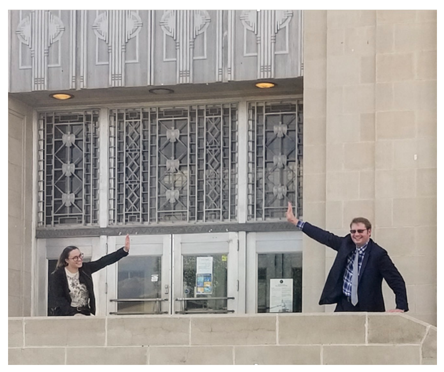
Outside Roosevelt County Courthouse after obtaining 90 ICAC grand jury subpoenas, Portales, June 19, 2020.