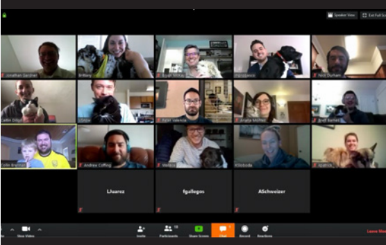
SPD Division Meeting April 2020 via Zoom (pets and kids welcome!).