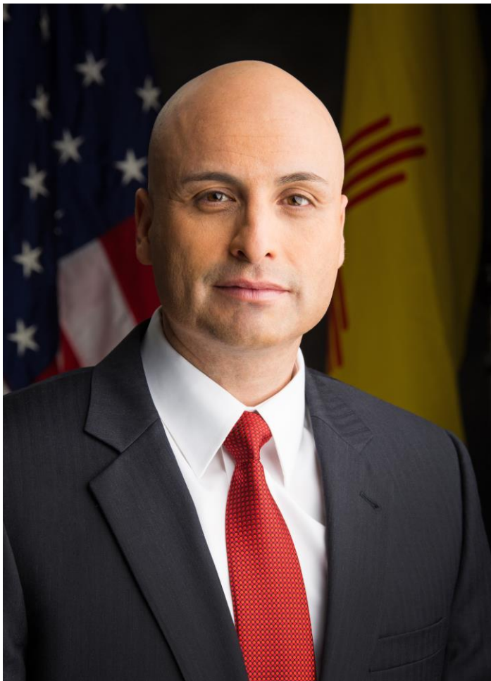
Attorney General Hector Balderas