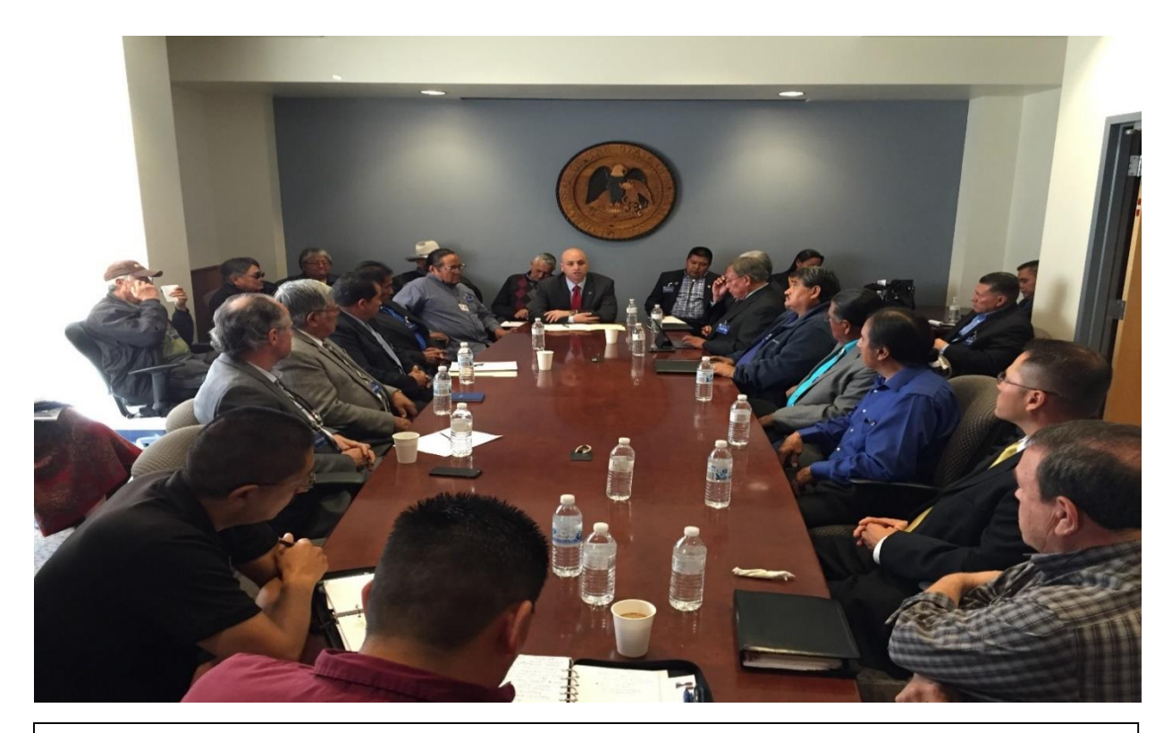
Attorney General Balderas meets with New Mexico tribal leaders after the Animas River chemical spill.