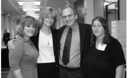
As a result, the Enhancing Enforcement of Orders of Protection in New Mexico, A Best Practices Guide for Law Enforcement, Prosecution and Courts, was drafted and approved by DOJ's Office of Violence Against Women. A training team conducted statewide Best Practices Guideline trainings. Nine trainings were conducted throughout the state (approximately 500 attendees). As of July 1, 2009, the Best Practices Guide, accompanying curriculum and training materials, is being utilized by the New Mexico Department of Public Safety Academy. Two additional training resources are

protection in state and tribal jurisdictions in New Mexico. A task force comprised of representatives of law enforcement, prosecution and defense, judiciary, civil legal advocates, emergency dispatch, therapists, victim advocates, and other stakeholders collaborated to identify and adapt replicable best practice models for protection order enforcement.