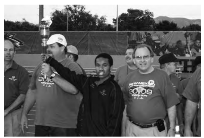
Special Olympics Law Enforcement Torch Run