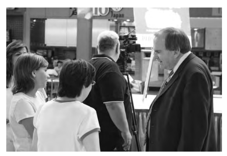
WebWise Kids: Parents Internet Safety Program Roll-Out