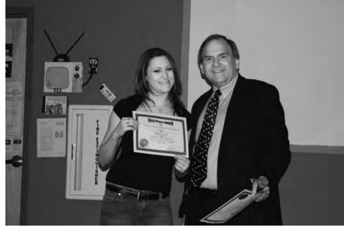
Alcohol Awareness Video Challenge Awards