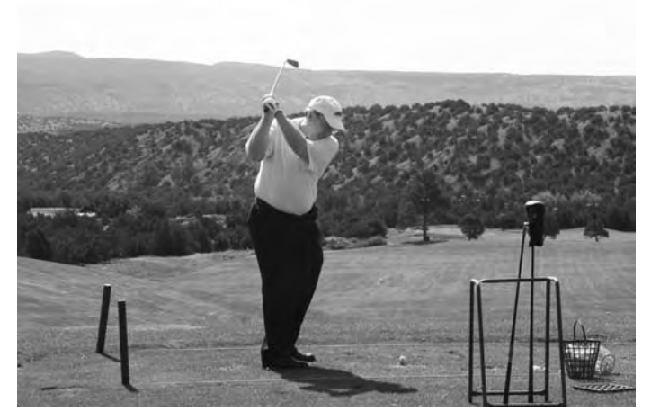
Golf Tournament Fundraiser for the Special Olympics Law Enforcement Torch Run