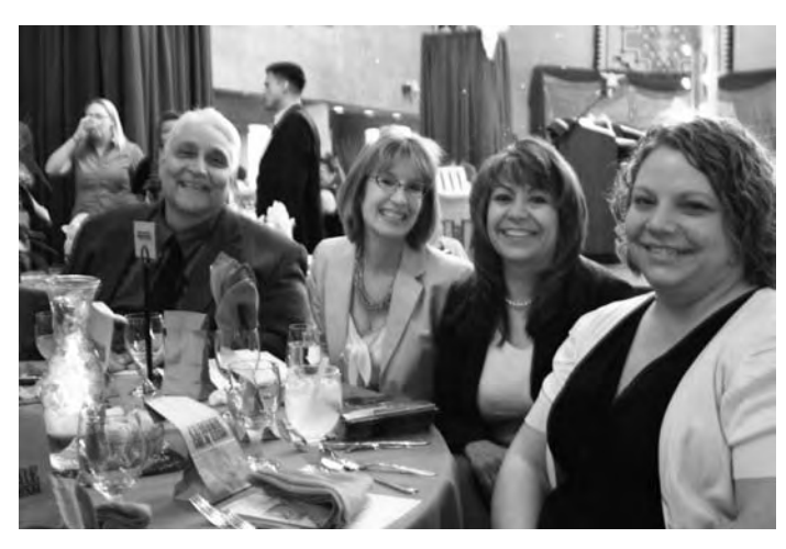
Part of the Meth Awareness Task Force at the NMPRSA Cumbre Awards