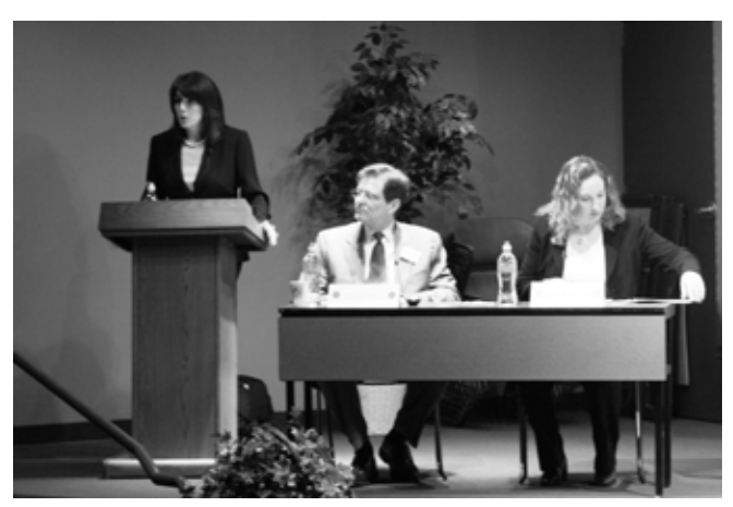
HUMAN TRAFFICKING TRAINING

assistance to the task forces within their individual communities; and overall encouragement and support of related activities. The division is working to further develop a proactive law enforcement investigative capability for human trafficking and is seeking additional federal funding to support human trafficking efforts. BVD plans to increase services for extradition and/or foreign prosecution of wanted persons located in foreign countries, particularly Mexico. In addition, the division looks to increasingly address borderrelated policies and criminal justice reform with Mexican states.